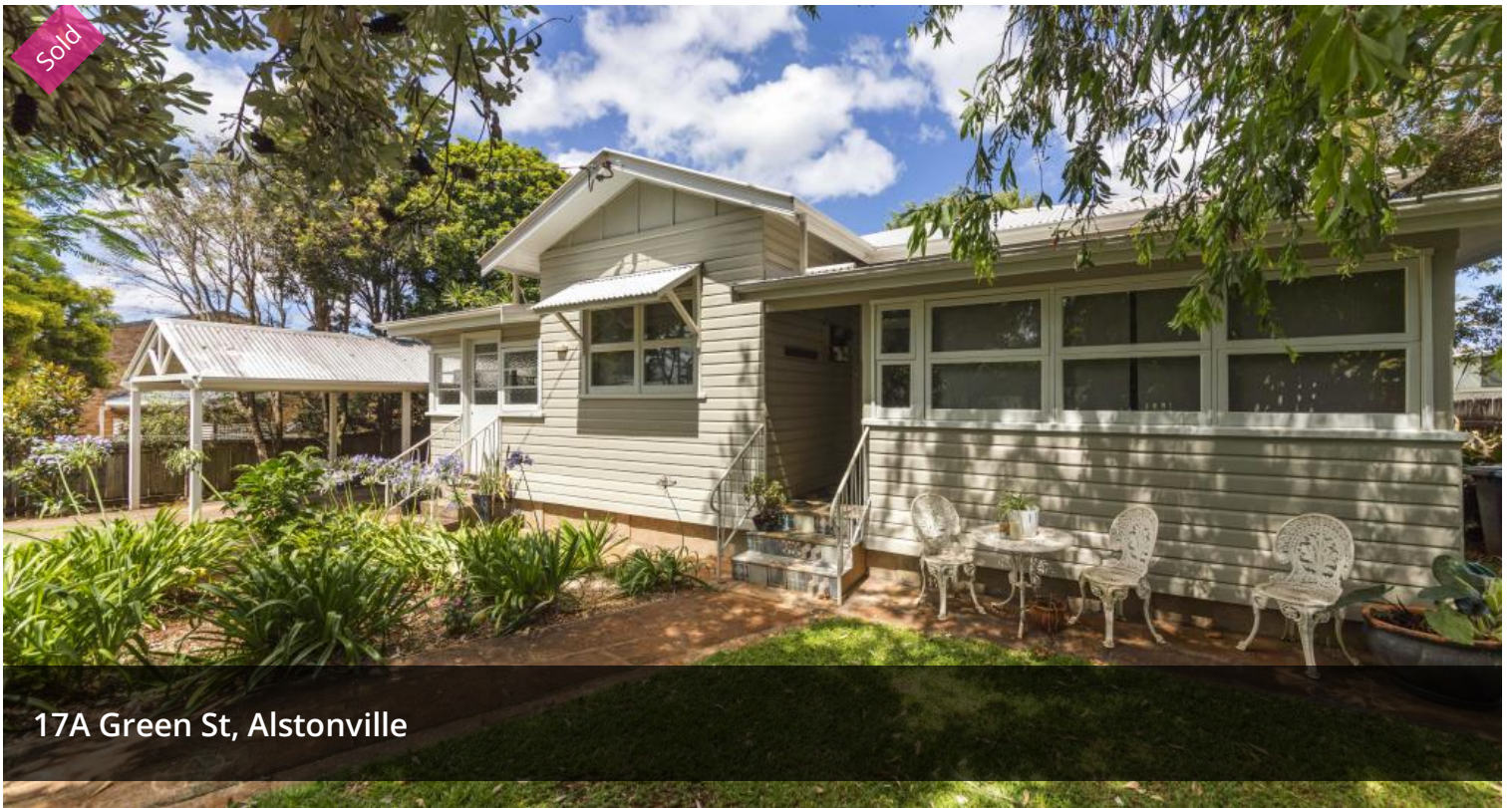
17A Green St, Alstonville