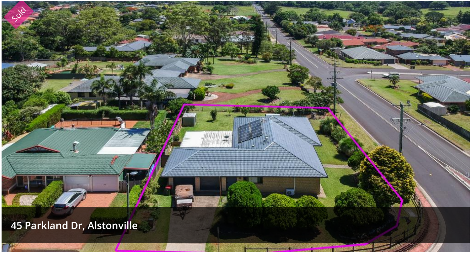
45 Parkland Dr, Alstonville