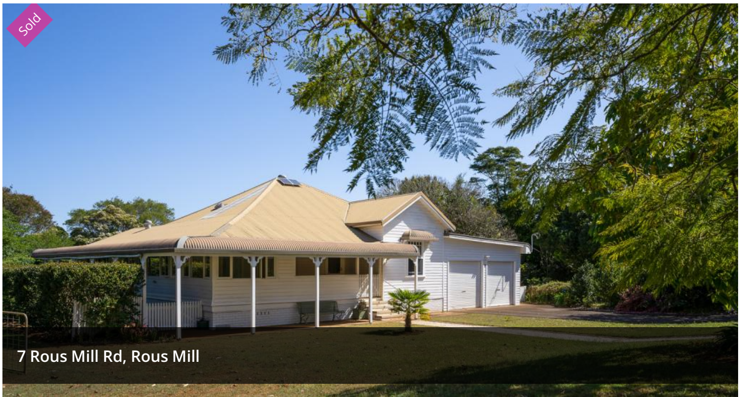
7 Rous Mill Rd, Rous Mill