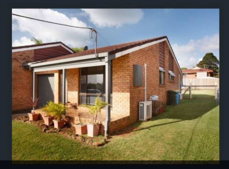
Unit 2, 8 Arrowsmith Ave, Alstonville