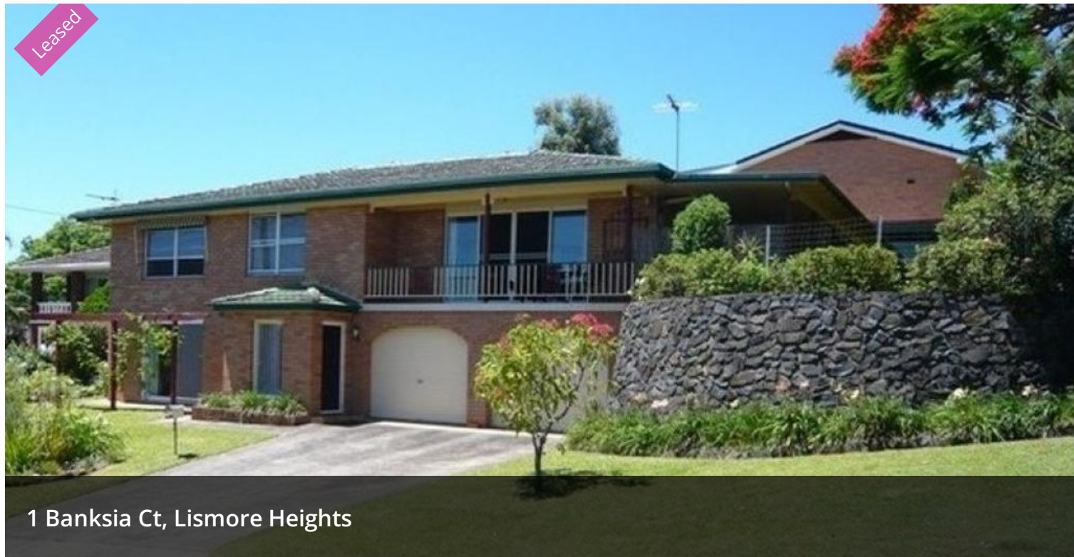
1 Banksia Ct, Lismore Heights