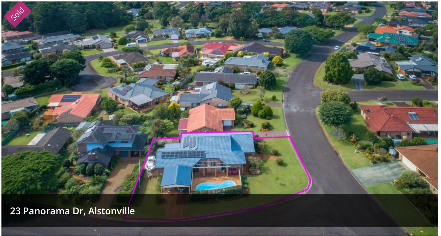
23 Panorama Dr, Alstonville