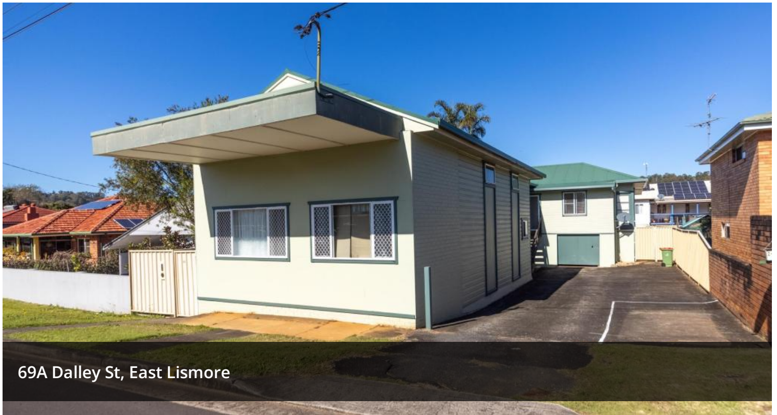
69A Dalley St, East Lismore