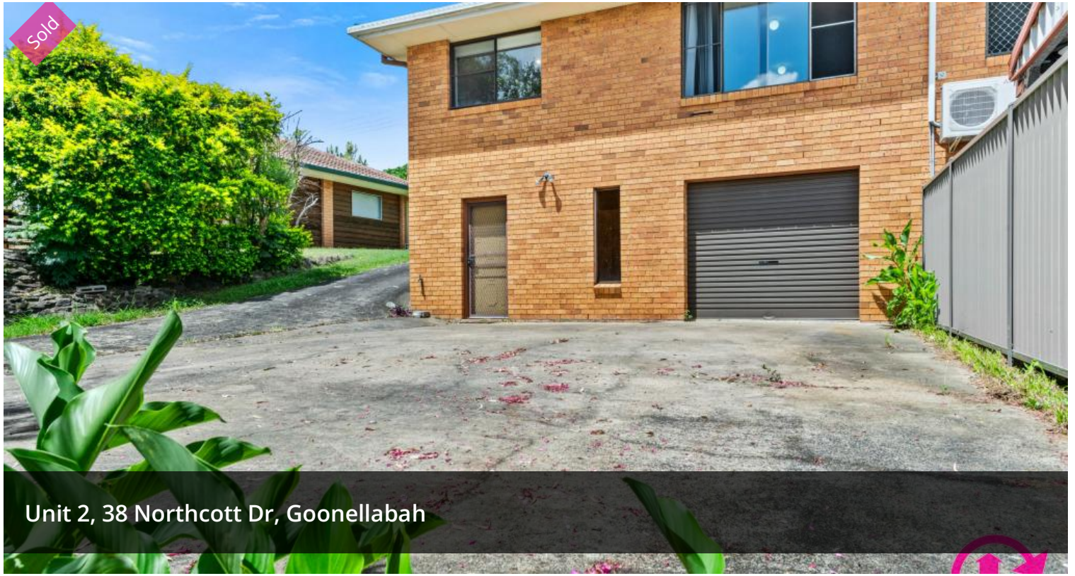
Unit 2, 38 Northcott Dr, Goonellabah