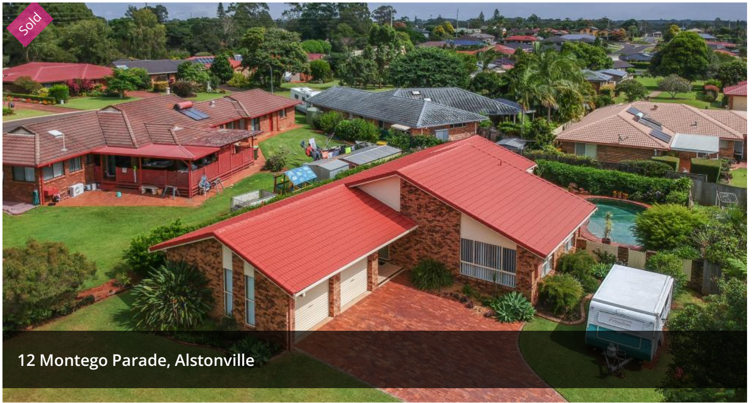
12 Montego Parade, Alstonville