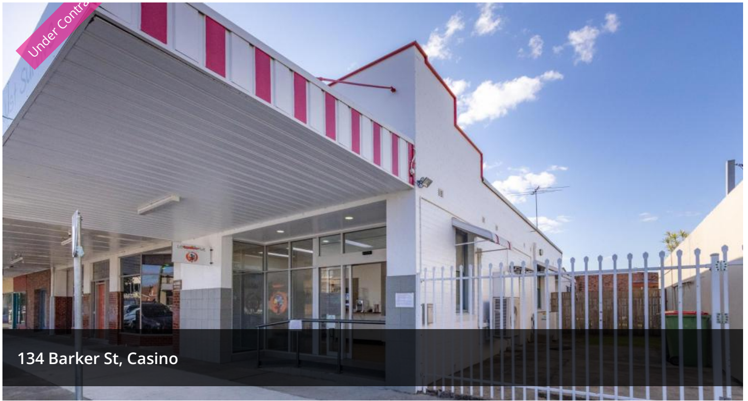
134 Barker St, Casino