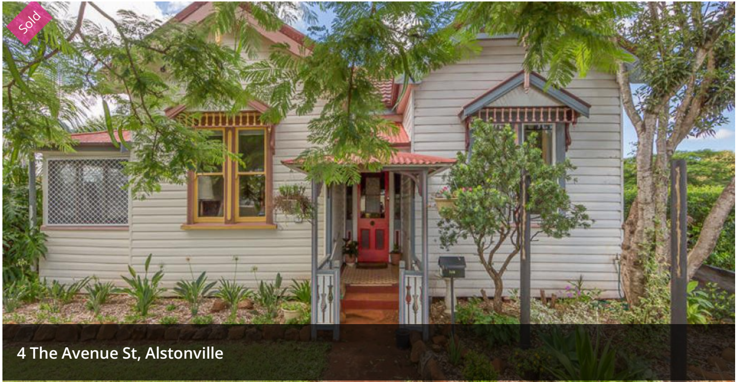
4 The Avenue St, Alstonville