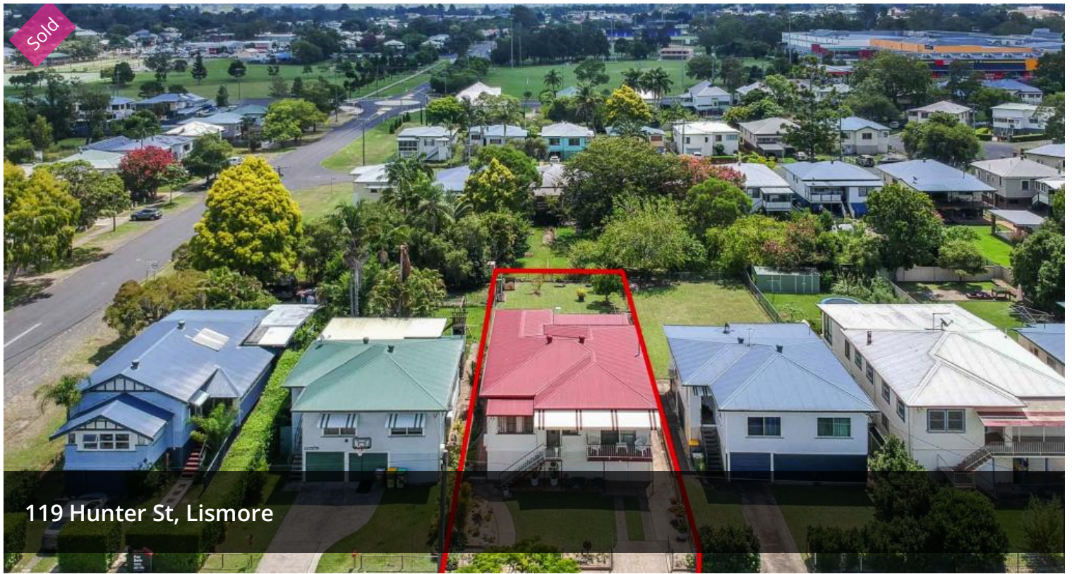
119 Hunter St, Lismore