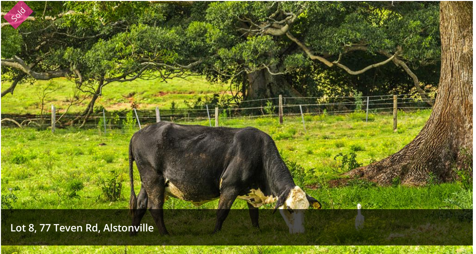
Lot 8, 77 Teven Rd, Alstonville