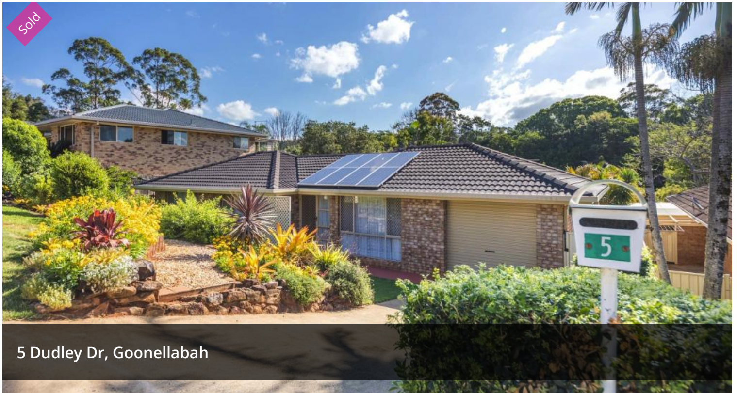
5 Dudley Dr, Goonellabah