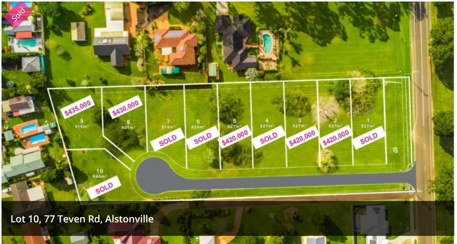
Lot 10, 77 Teven Rd, Alstonville